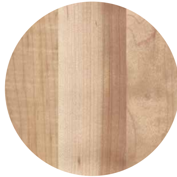
Grade 2 Maple