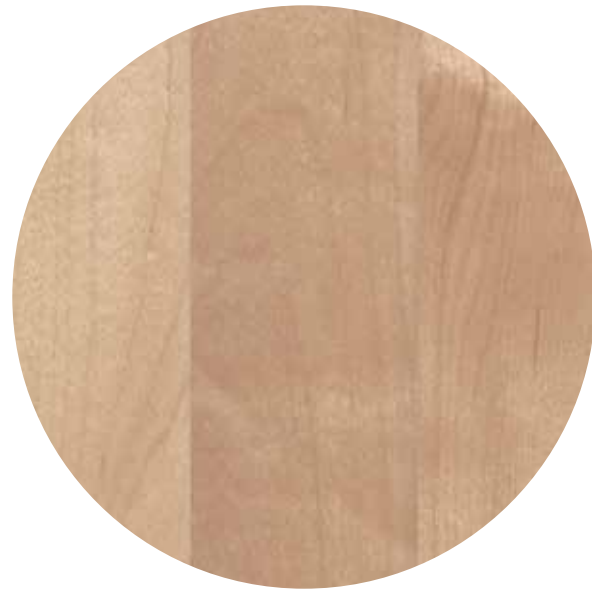
Grade 1 Maple