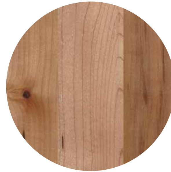
Grade 3 Maple